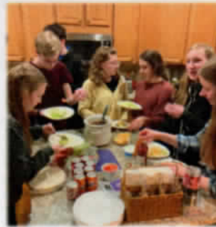
Food Art Night at Cottage Grove Bible Club

We are excited for the start of a new year of Bible clubs which begins September 12th. During these weekly events run in homes in various communities, teens play creative games, listen to Gospel-centered messages, and develop important social connections. TFC prepares teen leadership teams in each community to plan and run these clubs alongside a TFC staff person.